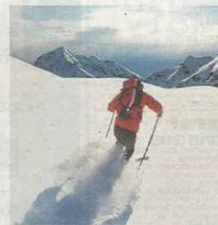
Learning curve: Master your ski moves

BREAKING through the barrier from being an amateur skier to becoming a pro can be tough. But this winter, Powder White is launching a six-day package to help snow bunnies master the ultimate ski skills. With five three-hour ski skill sessions, the course, based in Méribel, includes tuition in off-piste and cross-country skiing, moguls and freestyle.