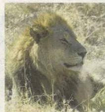
Roar talent: Learn a skill while on safari

From £949, including seven nights in a fully catered chalet, ski pass, ski equipment hire and tuition, powderwhite.com