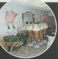
Intricate: Corn, white chocolate, honey and mango, Alinea-style. Inset: how the Madrid pop-up could look

of the NH Collection Eurobuilding, which also runs the Living Lab, a laboratory where guests can test out the latest technological advances.